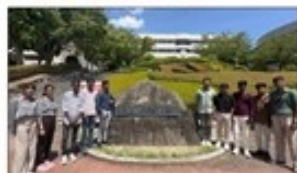
Kyutech Kyushu Institute of Technology Japan