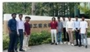
愛知工業大学 Aichi Institute of Technology Japan