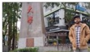
國立陽明大學 National Sun Yat-sen University Taiwan