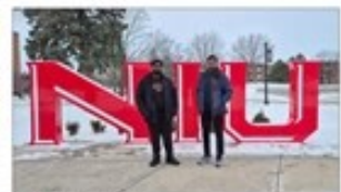
Northern Illinois University United States