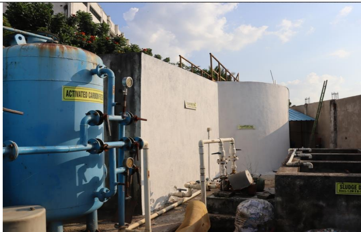
Pressure Filter Units